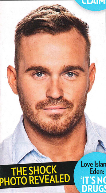
THE SHOCK PHOTO REVEALED