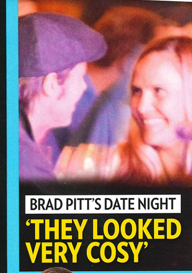
BRAD PITT'S DATE NIGHT 'THEY LOOKED VERY COSY'