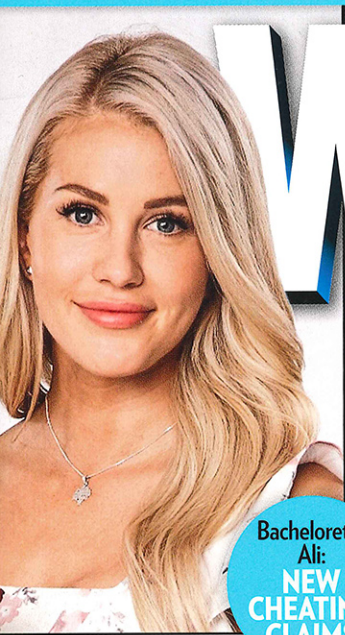
Bachelorette Ali: NEW CHEATING CLAIMS