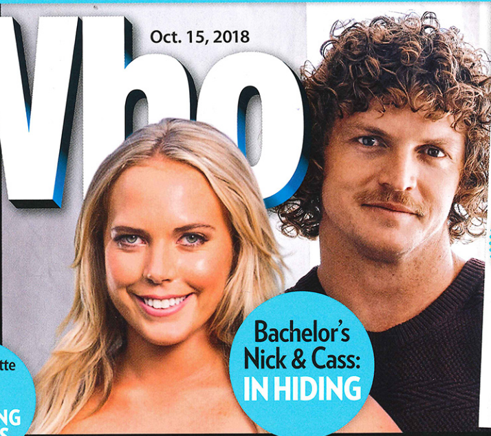
Bachelor's Nick & Cass: IN HIDING