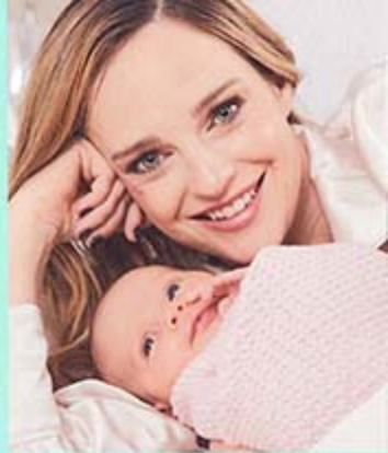
Home and Away's PENNY McNAMEE