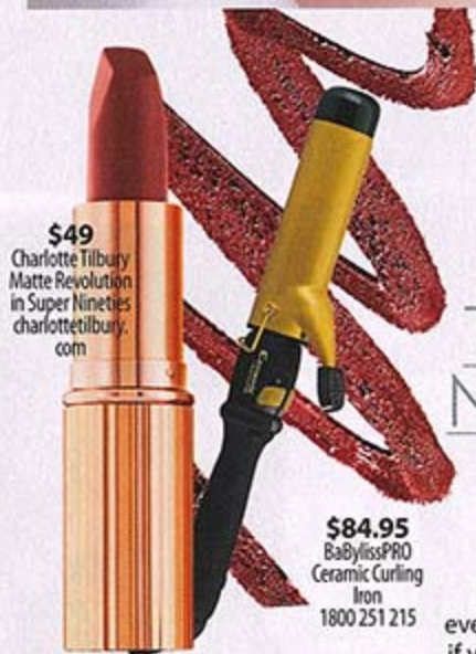
$49 Charlotte Tilbury Matte Revolution in Super Nineties charlottetilbury.com

"I also love yoga and Pilates, so don't mind a bit of 'me time' on my yoga mat. It makes me feel grounded and happy and I think when I'm truly happy and smiling and with my family, I feel the most beautiful." – Pia Miller.