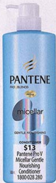
PANTENE PRO-V BLEND micellar GENTLE NOURISHING CONDITIONER $13 Pantene Pro-V Micellar Gentle Nourishing Conditioner 1800.028.280

"A good hair day is everything. I always feel like if you have a good hair day, you have the confidence to do anything," says Pia Miller.