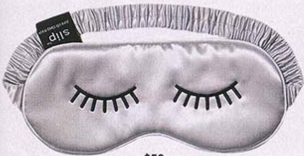
$50 Slip Silk Sleeping Mask slip.com.au

Whether it be PJs, a mask, a pillowcase or sheets, once you sleep on silk, you won't go back.