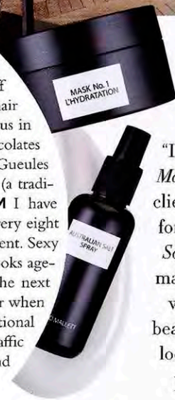
From top: David Mallett Mask No. 1 L'Hydratation, $99, and Australian Salt Spray, $54; Mason Pearson Handy Pure Bristle Bush (medium), $295; Parlux Parloux 3200 Ceramic and Ionic Charcoal hairdryer, $200.

Natalie Portman, who I've worked with for 13 years and