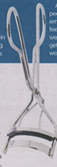
6 Shu Uemura Eyelash Curler ($29, available from David Jones). This is engineered to be gentler on the eyes while giving lashes the ultimate bend. Perfect for everyday use.