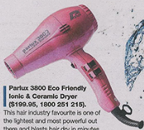
1 Parlux 3800 Eco Friendly Ionic & Ceramic Dryer ($199.95, 1800 251 215).

This hair industry favourite is one of the lightest and most powerful out there and blasts hair dry in minutes.