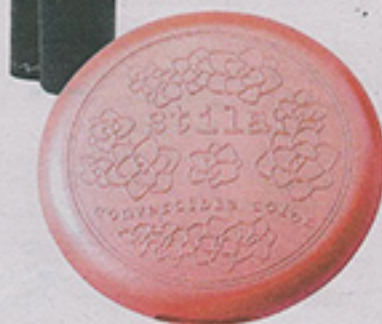
3 Stila Convertible Colour in Petunia ($40, meccacosmetica.com.au ).

This perk-me-up cream stain can be used on both lips and cheeks.