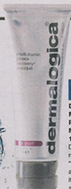
10 Dermalogica Multivitamin Power Recovery Masque ($68, 1800 659 118). Deliver instant radiance with this "juice cleanse in a tube" thanks to its vitamins A, C, E and pro-vitamin B5.