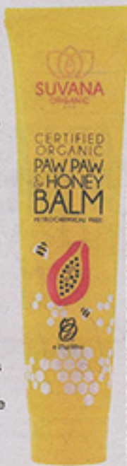
8 Suvana Certified Organic Paw Paw & Honey Balm ($7.99, available from Priceline). An organic paw paw ointment that's an all-round wonder salve.

WORDS: SIOBHAN GAVELLO