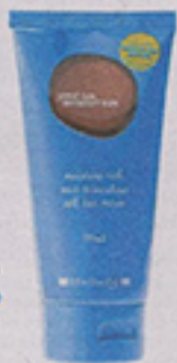
7 Ella Baché Great Tan Without Sun ($40, 1800 789 234). This contains cocoa butter and green tea to hydrate skin and builds to form a natural-looking golden tan.