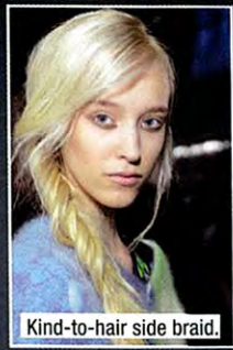
Kind-to-hair side braid.

It's every busy girl's go-to 'do, and it sure feels good raking that wet hair straight up off your neck. But, like most fast fixes, it isn't very good for your tresses. "When hair is wet, it's more fragile and likely to split, so you should try and let it dry before styling it into any kind of up-do," warns Hampton. How to fix it: He recommends brushing wet hair with a paddle brush or a wide-tooth comb to gently untangle knots. Then, secure the hair with a cotton band, "as a bare elastic can catch on the hair, causing breakage," he adds. When you can't leave your hair down to air-dry, work in a basic leave-in conditioner through the lengths and side braid it. It looks way cooler than a boring bun and treats your hair at the same time. ➔