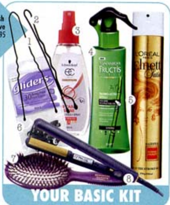
YOUR BASIC KIT