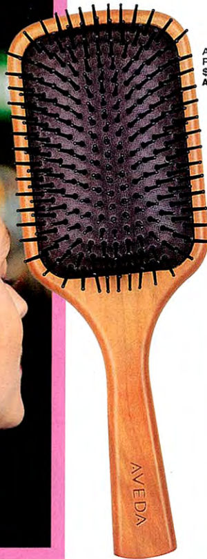
AVEDA WOODEN PADDLE BRUSH, $49.95, AVEDA.COM.AU