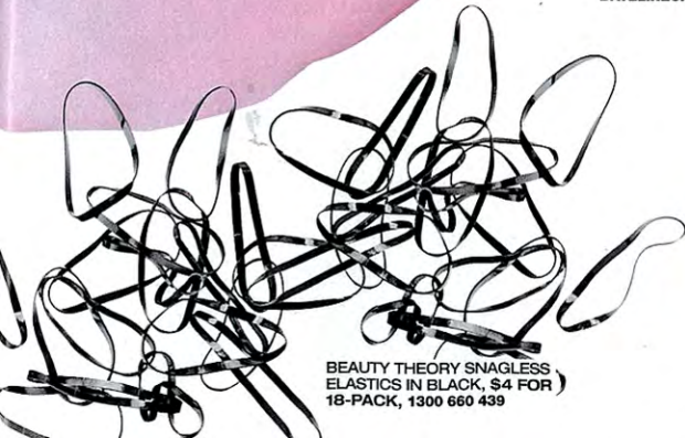
BEAUTY THEORY SNAGLESS ELASTICS IN BLACK, $4 FOR 18-PACK, 1300 660 439