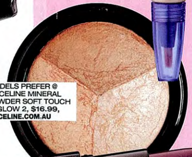
MODELS PREFER @ PRICELINE MINERAL POWDER SOFT TOUCH IN GLOW 2, $16.99, PRICELINE.COM.AU