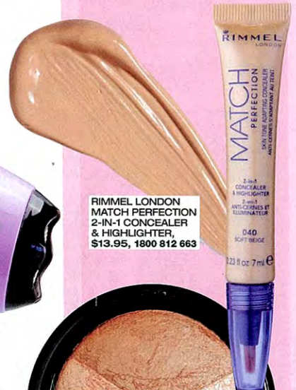
RIMMEL LONDON MATCH PERFECTION 2-IN-1 CONCEALER & HIGHLIGHTER, $13.95, 1800 812 663