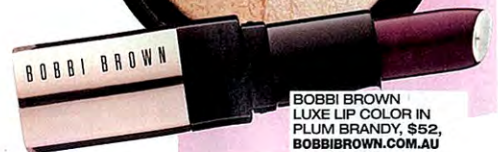
BOBBI BROWN LUXE LIP COLOR IN PLUM BRANDY, $52, BOBBIBROWN.COM.AU