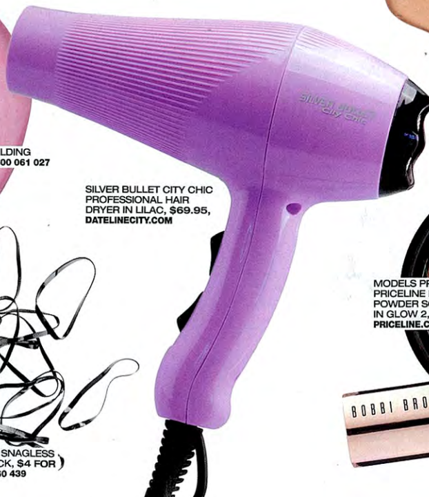
SILVER BULLET CITY CHIC PROFESSIONAL HAIR DRYER IN LILAC, $69.95, DATELINECITY.COM