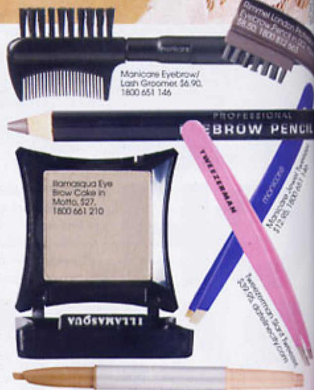
Clinique Instant Lift for Brows, $38, 1800 556 948

In your kit you should have: a set of tweezers preferably with a slanted or pointy edge to help catch fine hairs; eyebrow brush/comb for grooming; and a double-ended blonde/brown pencil to suit your hair and skin tone.