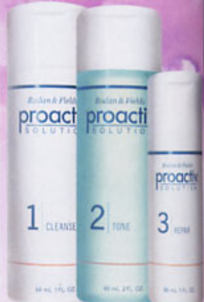
New Proactiv 3-Step System (30 day supply) $29.95 + $9.95 postage and handling. newproactiv.com.au

You know the brand - it's like a sister to you all. Well, that very sister has undergone a makeover. It's now gentler*, plus the benzoyl peroxide (key to fighting zits) has even been swankified with new microcrystal technology which helps them get right to the source of the pimples to beat 'em before the breakout. Yay!