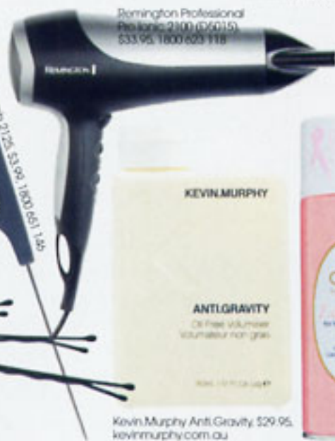
Remington Professional Professional 2100. $33.95. 1800 629 118