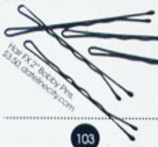
Hair FX 2 Bobby Pins. $3.50. dotdirect.com