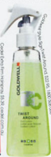
Goldwell Style Spray. Around $22.95. 1800 506 060