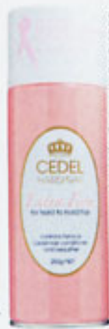
CEDER Extra Firm Volumizer. $5.99. cedel.com.au

Kevin.Murphy Anti Gravity. $29.95. kevinmurphy.com.au