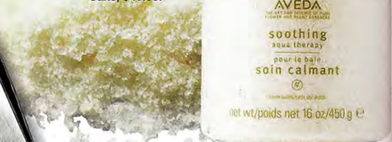
Aveda Soothing Aqua Therapy Bath Salts, $49.95.

"I tweeze my eyebrows a bit without altering their natural curve."