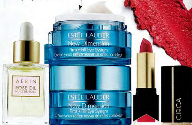
Estée Lauder New Dimension Firm + Fill Eye System, $140.

"I like all beauty products, especially body oils."