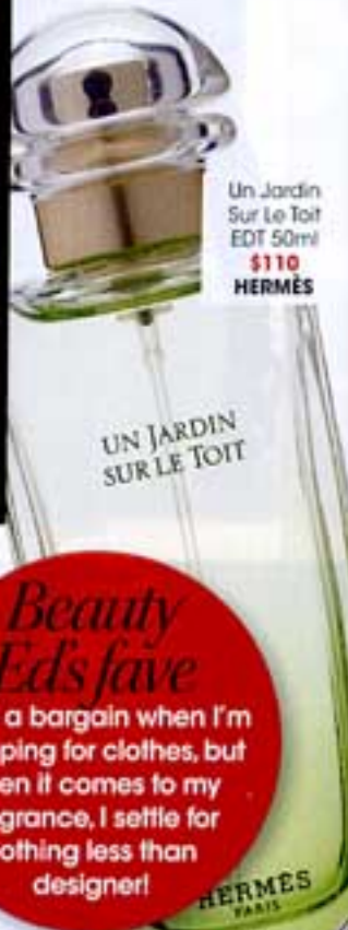
Un Jardin Sur Le Toit EDT 50ml $110 HERMÈS