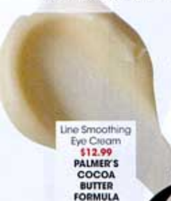
Line Smoothing Eye Cream $12.99 PALMER'S COCOA BUTTER FORMULA