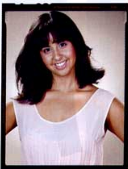
Shimmering Skin Perfector $66 BECCA