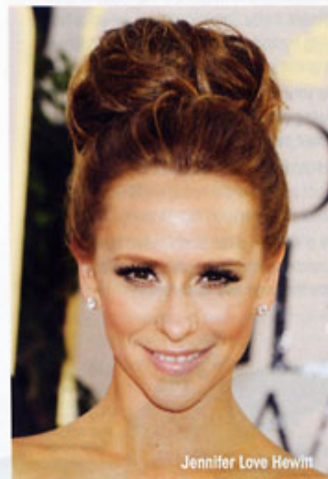
Jennifer Love Hewitt