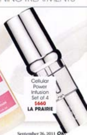
Cellular Power Infusion Set of 4 $660 LA PRAIRIE

TEXT & STYLING BY SHARON GOLDSTEIN PHOTOGRAPH BY WIREIMAGE STILL LIFE PHOTOGRAPHS BY CHRIS JANSEN @ ACP PHOTOGRAPHS WHERE TO BUY: BRUSHWORX 1800 251 215 CLINIQUE 1800 556 946 ESTÉE LAUDER 1800 061 336 HAIR FX 1800 251 215 LANCÔME 0201 9031 8888 LA PRAIRIE 1800 251 0110 L'ORÉAL PARIS 1300 659 359 SUPER BY DR NICHOLAS PERRICONE 1800 750 800 WILD LIFE HAIR WILDLIFEHAIR.COM