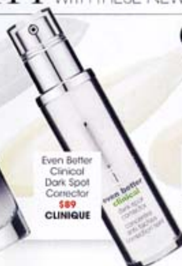
Even Better Clinical Dark Spot Corrector $89 CLINIQUE