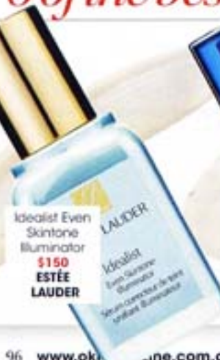
Idealist Even Skintone Illuminator $150 ESTÉE LAUDER