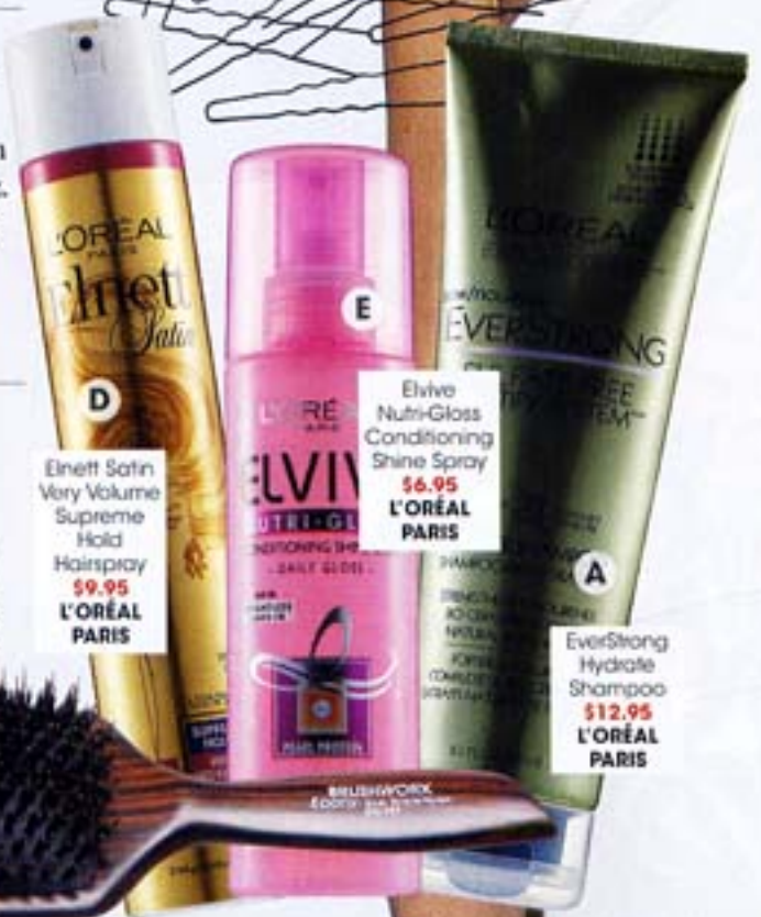
Ebony Porcupine Paddle Brush $19.95 BRUSHWORX