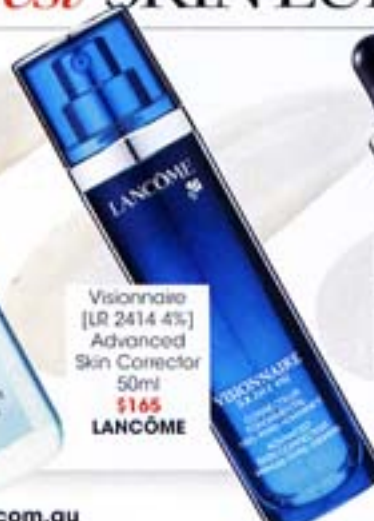
Visionnaire [LR 2414 4%] Advanced Skin Corrector 50ml $165 LANCÔME