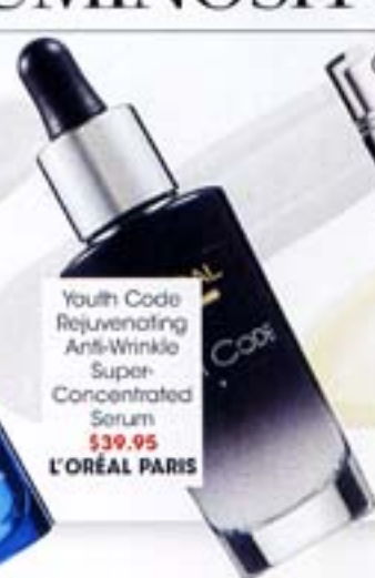
Youth Code Rejuvenating Anti-Wrinkle Super-Concentrated Serum $39.95 L'ORÉAL PARIS