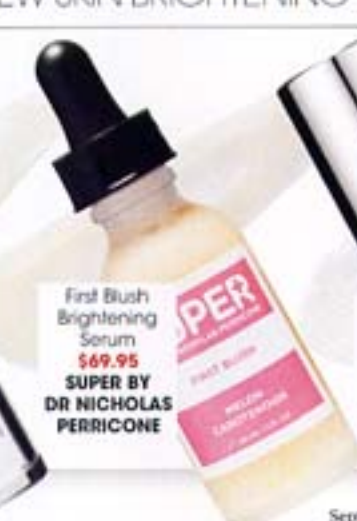
First Blush Brightening Serum $69.95 SUPER BY DR NICHOLAS PERRICONE