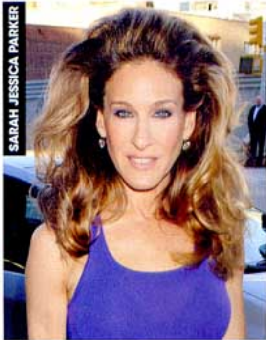
SARAH JESSICA PARKER