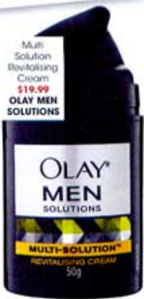
Multi- Solution Revitalising Cream $19.99 OLAY MEN SOLUTIONS

STYLING BY SHARON GOLDSTEIN & MAVA WYSZYNSKI