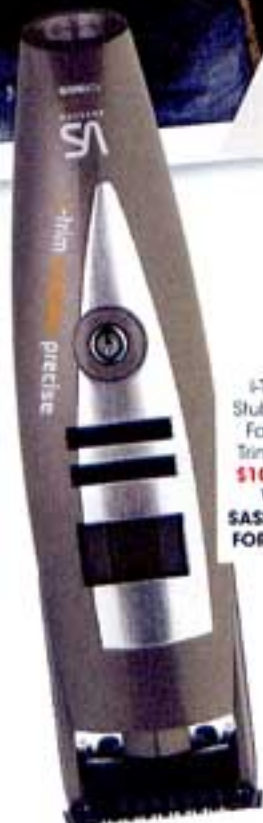
i-Trim Stubble+ Facial Timmer $102.95 VS SASSOON FOR MEN