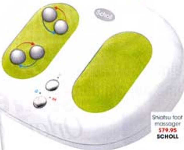
Shiatsu foot massager $79.95 SCHOLL