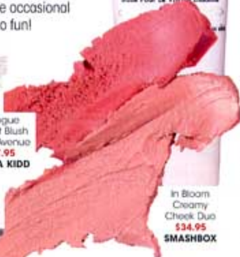
In Bloom Creamy Cheek Duo $34.95 SMASHBOX