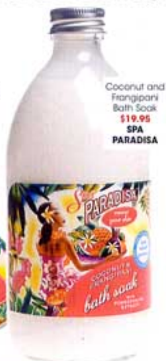
Coconut and Frangipani Bath Soak $19.95 SPA PARADISA

If your old hair straightener has died or you're ready to invest in a salon-quality hairdryer, look no further than the i-glamour website. This online shopping spot not only stocks a range of professional electrical hair products from brands like BaByliss PRO, Parlux and Silver Bullet, it also features haircare, tanning, waxing, hair extensions and body products. The offer of free delivery for all orders over $50 seals the deal!