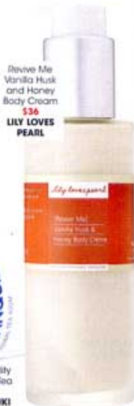
Revive Me Vanilla Husk and Honey Body Cream $36 LILY LOVES PEARL

If organic brands are your thing, you can enjoy an eco-friendly beauty blitz at the Pukka website. Specialising in brands that are good for both you and the planet, this site stocks Australian names like Inika, Be Genki and Lily Loves Pearl. In addition to skincare, mineral make-up, hair and body products, they also stock sunscreens, natural perfumes, baby-friendly goods and even oral hygiene products. Being green has never been so convenient.