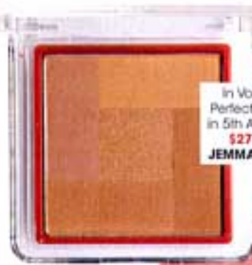
In Vogue Perfect Blush in 5th Avenue $27.95 JEMMA KIDD