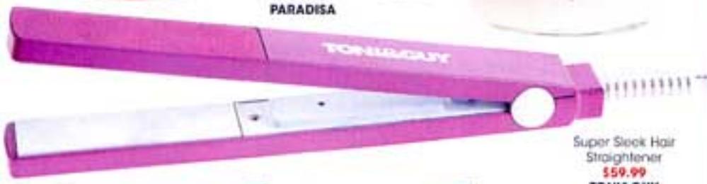
Super Sleek Hair Straightener $59.99 TONI&GUY