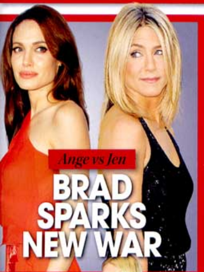
Angelina vs Jen