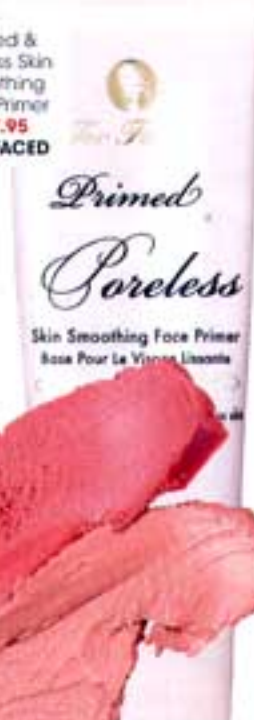
Primed & Poreless Skin Smoothing Face Primer $57.95 TOO FACED

Bring the energy and excitement of a visit to a Kit store onto your computer screen with a click through to their online shop. Just like in store, the website stocks those skincare and make-up brands that can't be found elsewhere in Australia, like Pop Beauty, Jemma Kidd, Too Faced, Smashbox and Soap & Glory. In addition to all the online shopping fun, the site also offers a tip-filled blog, lists of upcoming in-store events and the occasional online-only beauty promotion. Too fun!