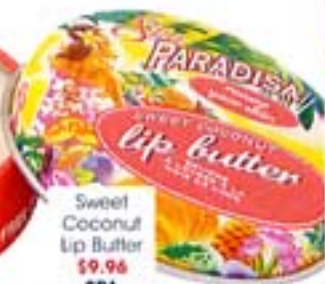
Sweet Coconut Lip Butter $9.96 SPA PARADISA