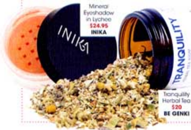
Mineral Eyeshadow in Lychee $24.95 INIKA