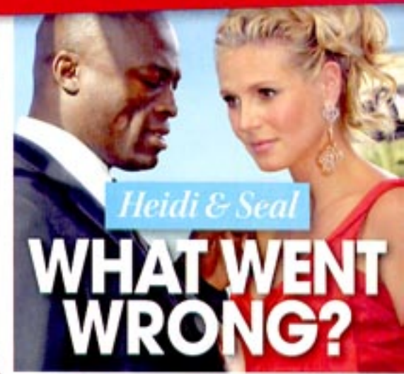
Heidi & Seal