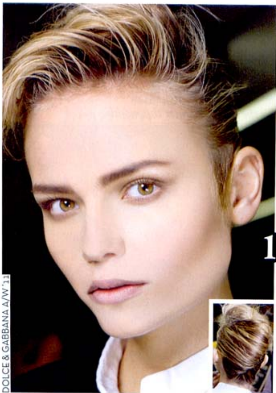
DOLCE & GABBANA A/W '11