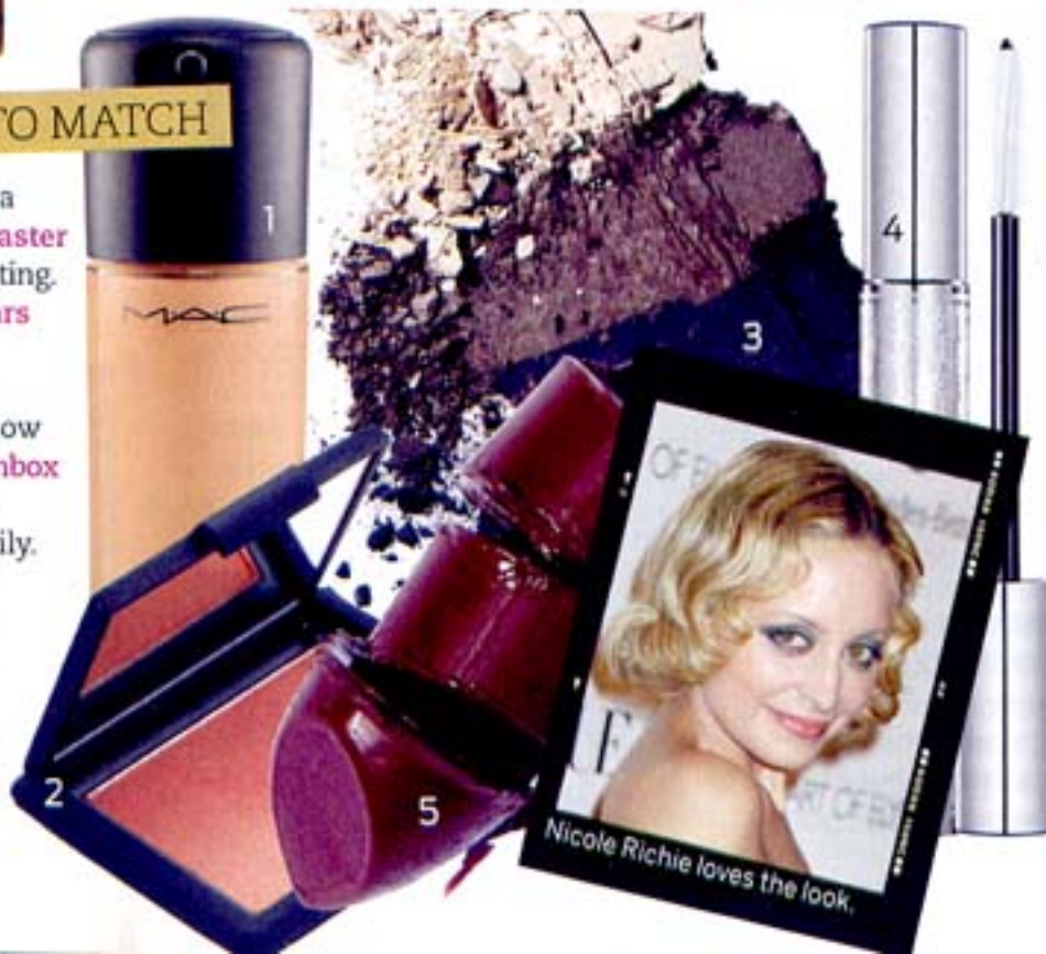
Nicole Richie loves the look.