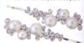
Redheads should go for old-world pearls. Diva Pearl Slides , $9.99, are a steal!