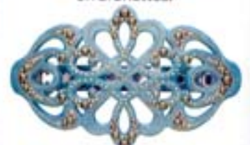
Bright bling suits blonde beauties. Slide Mimco Gypsy Barrette in Jade , $49.95, into your side part.