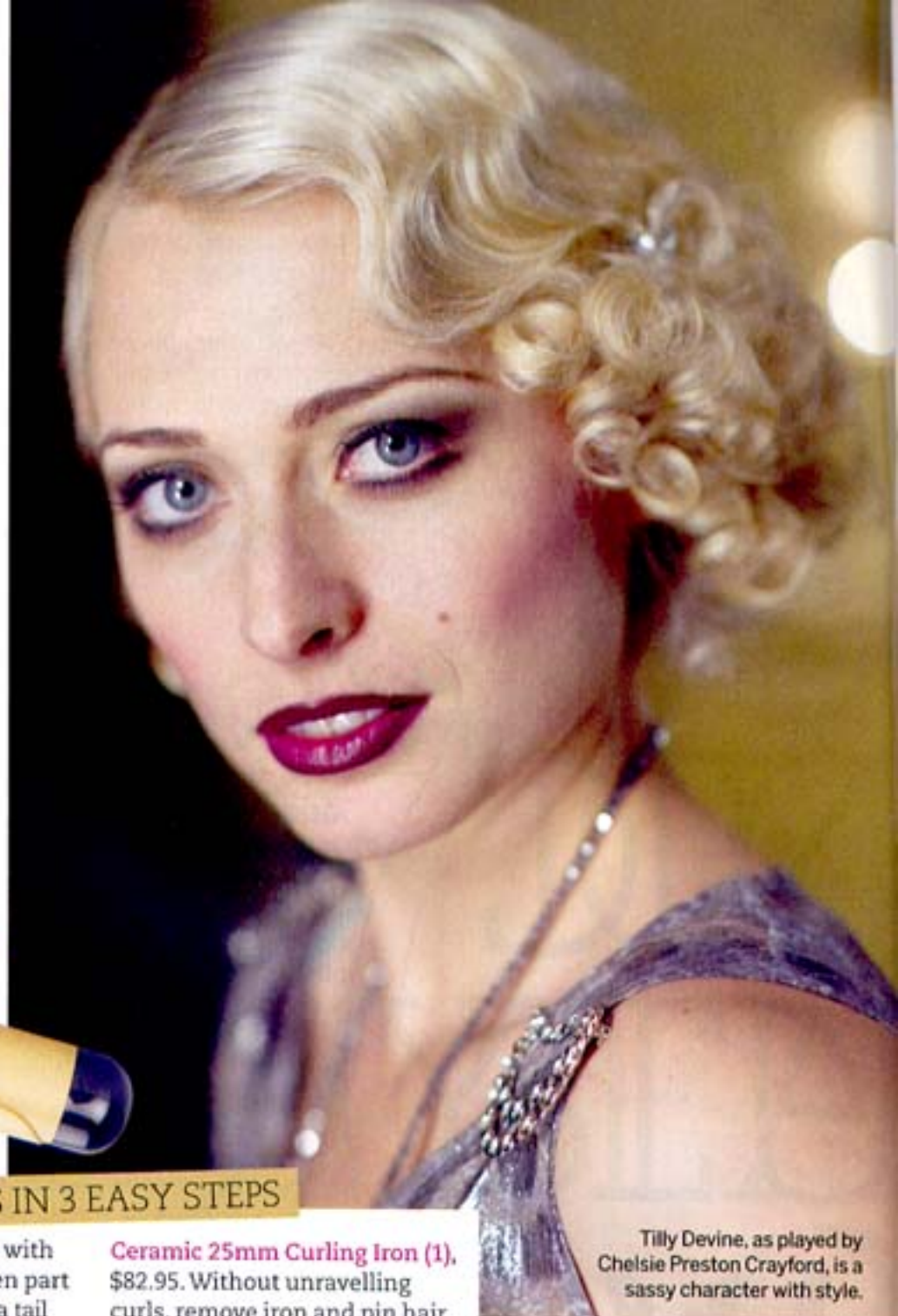
Tilly Devine, as played by Chelsie Preston Crayford, is a sassy character with style.

We love Tilly Devine's vampy look in Underbelly Razor . Here's how to copy the style.