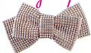
George Giavis Swarovski Bow in White , $159.95, looks beautiful on brunettes.