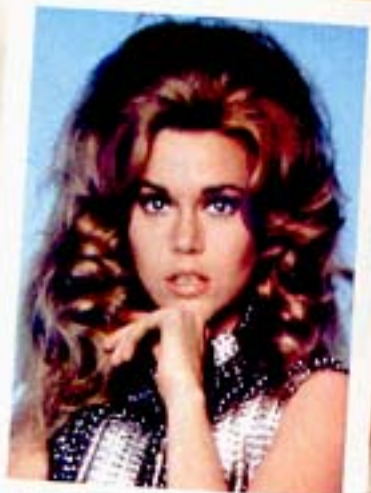
INSPIRATION Big, full-on hair as worn by Jane Fonda in 1968 film Barbarella .