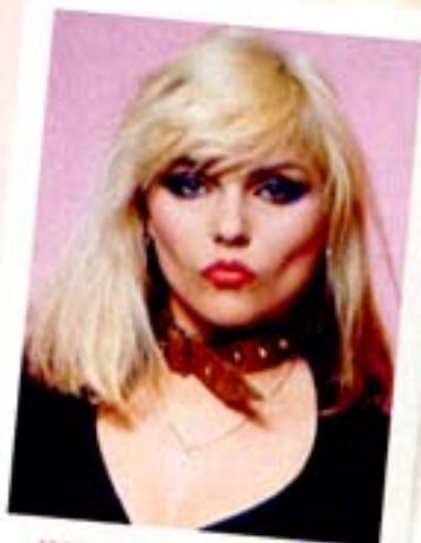
INSPIRATION Blondie singer Debbie Harry's sexy, dishevelled hair and smouldering cat's eyes.

Use upward brush strokes with shadows and a soft kohl pencil like Jane Iredale Pencil Crayon in Basic Black (4) , $20, close to lashes. Give cheeks a chiselled look with bronzer, and your lips a creamy finish. Team St.Tropez Bronzing Rocks (1) , $64.95, and Benefit Full-Finish Lipstick in Mod Squad (3) , $36.