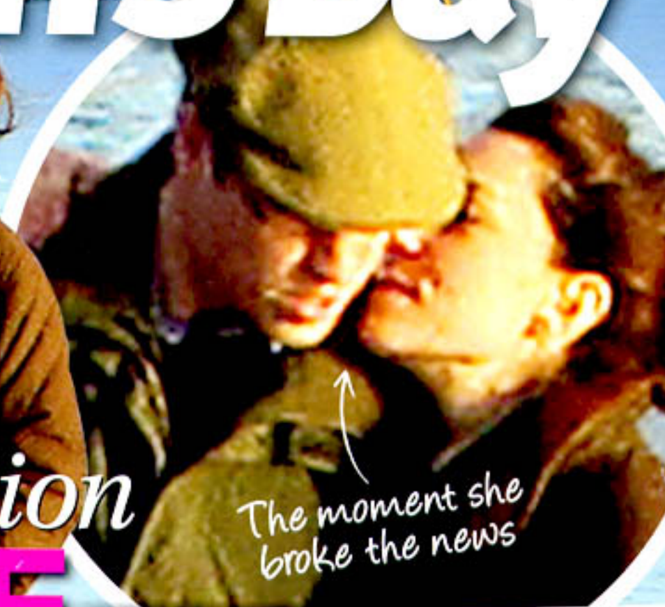
The moment she broke the news