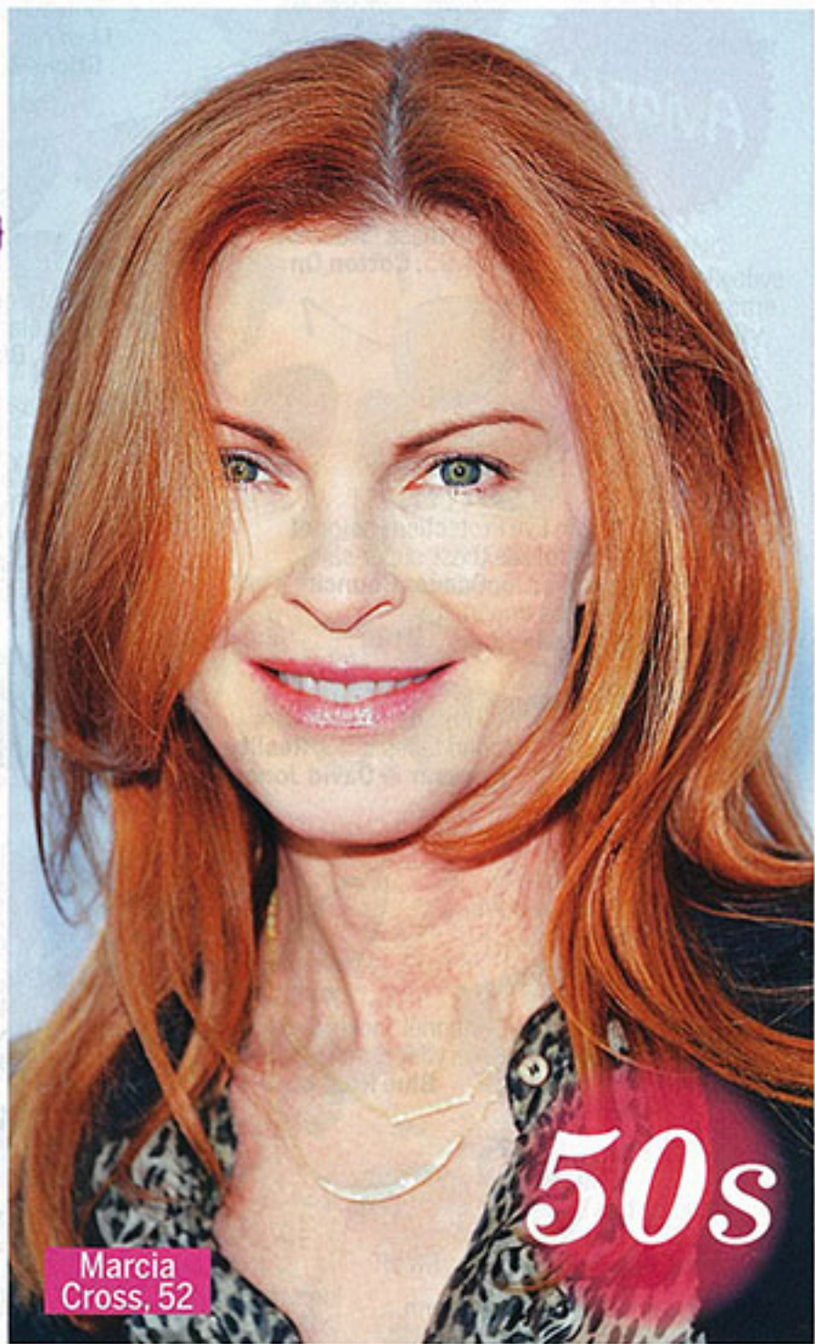
Marcia Cross, 52