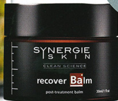
$59 Synergie Skin Recover Balm synergieskin.com

It is best to book into a professional to get your brows in perfect condition. Once you are happy with your shape, your daily maintenance will be a lot easier.