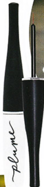
$152 Plume Cosmetics Inc. Lash & Brow Enhancing Serum mecca.com.au