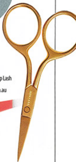
$31 Velour Too Sharp Lash Scissors sephora.com.au