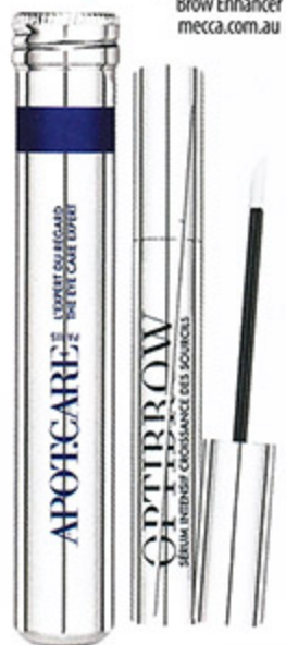
$69 Apot.Care OptiBrow Brow Enhancer mecca.com.au

Actress Charlize Theron uses castor oil on her brows. "Someone told me about it," she says. "I put it on my brows and scalp once or twice a week. It's definitely made my hair thicker." If you suffer from sparse brows that won't grow, or you just want to give them a little TLC, we've got you covered. Applying a serum while you sleep will help nurse brows back to health. Look for formulas that contain ingredients such as biotin to ensure you're getting the best brow fix. Or, for a celeb-worthy look, try castor oil like Theron. Apply directly onto brows with a brush, massage in and let it get to work. Winning!