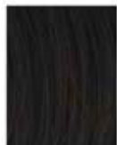
R4 Midnight Brown