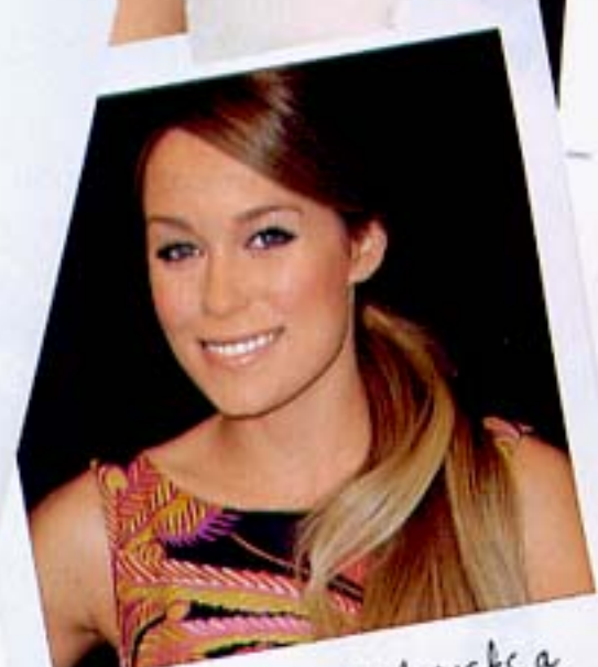
Lauren Conrad rocks a Rapunzel-esque ponytail.