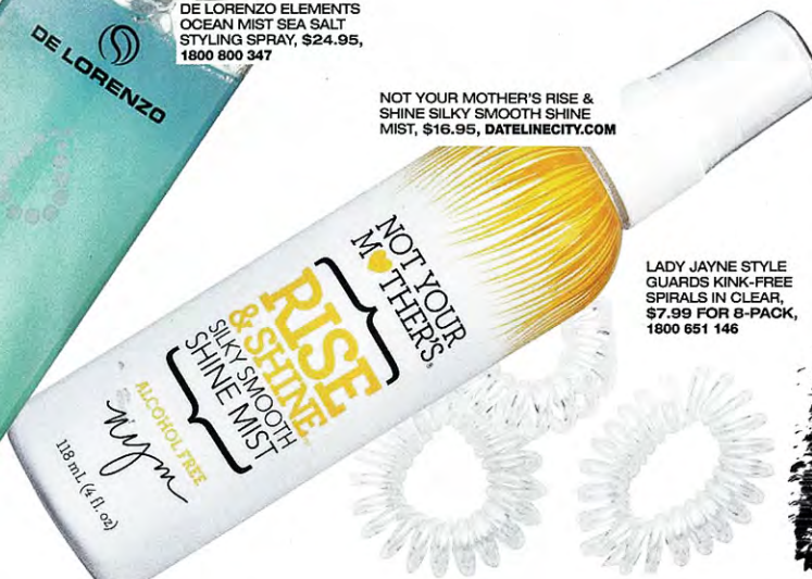
LADY JAYNE STYLE GUARDS KINK-FREE SPIRALS IN CLEAR, $7.99 FOR 8-PACK, 1800 651 146