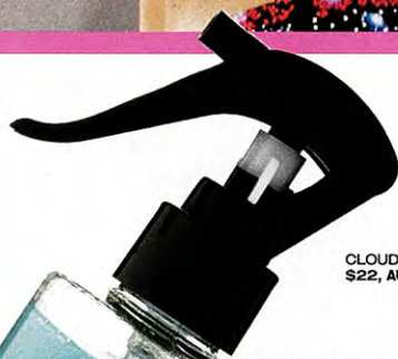
DE LORENZO ELEMENTS OCEAN MIST SEA SALT STYLING SPRAY, $24.95, 1800 800 347