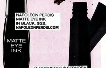
IT COSMETICS @ SEPHORA SUPERHERO ELASTIC STRETCH VOLUMIZING MASCARA IN SUPER BLACK, $38, 02 9221 5703