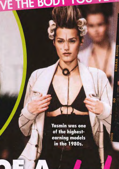
Yasmin was one of the highest-earning models in the 1980s.