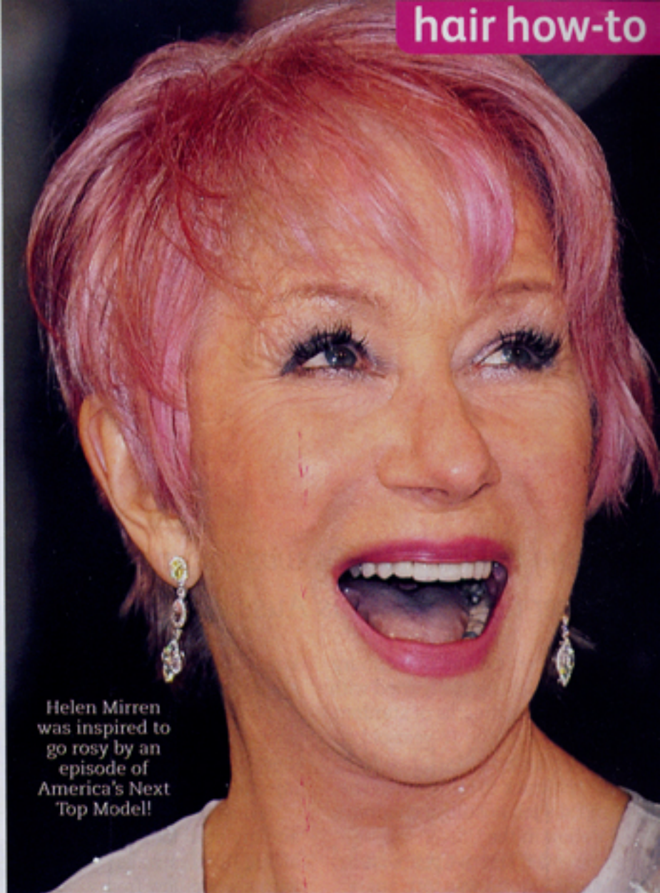
Helen Mirren was inspired to go rosy by an episode of America's Next Top Model !